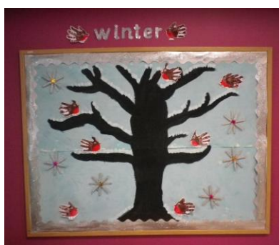
Hedgehog winter display

Lastly the Hedgehogs have helped us create our winter display, which we are all very proud of.