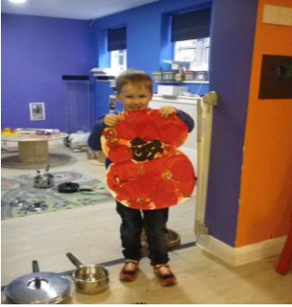
Owl Remembrance Craft