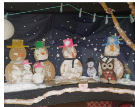
Squirrel Winter display

For Pudsey week the Hedgehogs took part in many different activities throughout the week including wearing red, spots, stripes and pyjamas, and then a cake sale to put the icing on the top of the